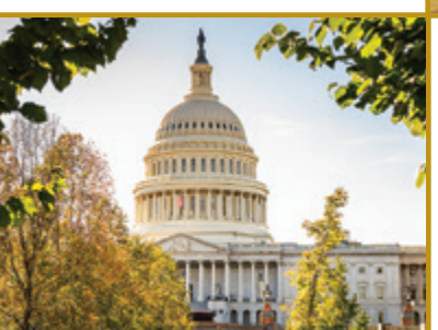
May 15, 2019 Renaissance Washington, D.C., Downtown Hotel Washington, D.C.