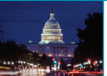
September 13-14, 2018 Grand Hyatt Washington Washington, D.C.