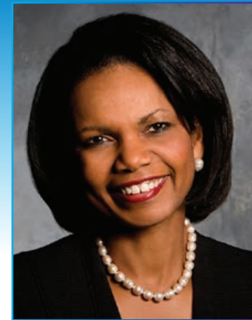
Dr. Condoleezza Rice

Senior Advisor to President Obama and Distinguished Fellow, University of Chicago Law School